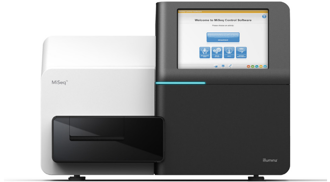
Figure 1: MiSeq System—The compact MiSeq System is well suited for rapid, cost-effective next-generation sequencing.

The MiSeq System offers the first DNA-to-data sequencing platform integrating cluster generation, amplification, sequencing, and data analysis into a single instrument. Its small footprint—approximately two square feet—fits easily into virtually any laboratory environment (Figure 1). The MiSeq System leverages Illumina sequencing by synthesis (SBS) chemistry, a proven next-generation sequencing (NGS) technology responsible for generating more than 90% of the world's sequencing data. 1 With the power of NGS delivered in a compact footprint, the MiSeq System is the ideal platform for rapid and cost-effective genetic analysis.