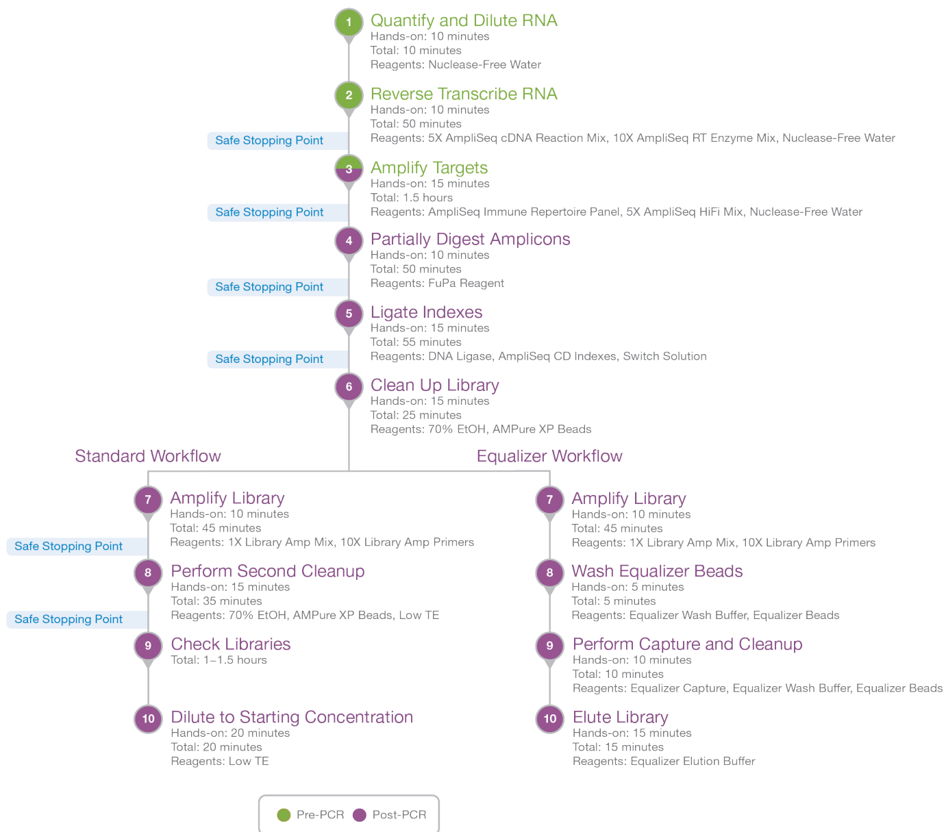
Figure 1 AmpliSeq Immune Repertoire Panel Workflow

The following diagram illustrates the AmpliSeq for Illumina Immune Repertoire Panel workflow. Safe stopping points are marked between steps.