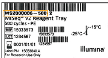
Figure 2 Reagent Cartridge Label

If the barcode number is not known, use a preferred name for the sample sheet followed by *.csv. When the software cannot locate the sample sheet during the run setup steps, browse to the appropriate sample sheet.