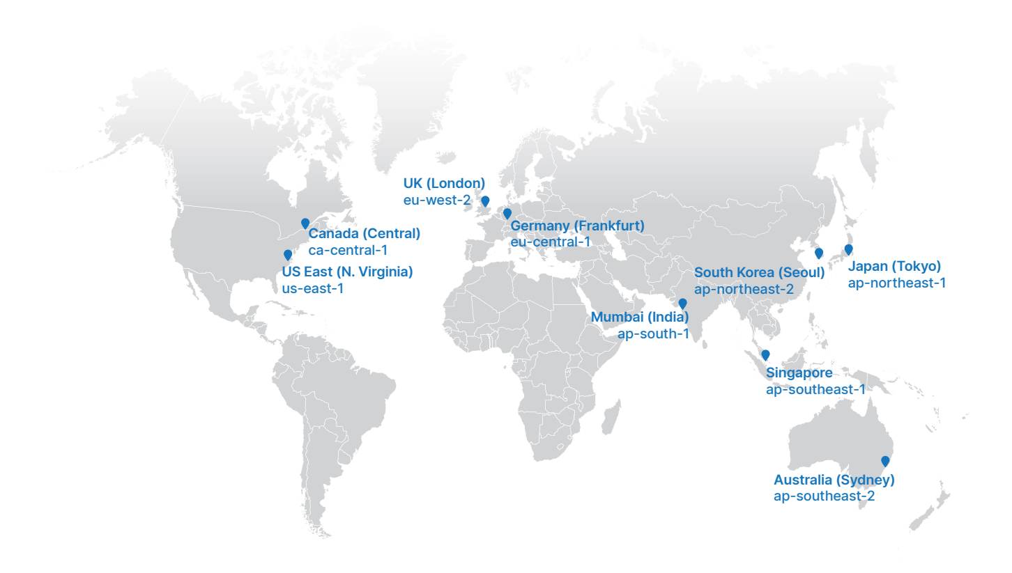
Figure 2: Global deployment of ICA on AWS regional data centers