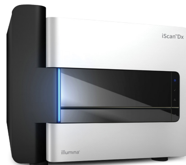
Figure 1: The iScanDx Instrument—A fully automated platform compatible with autoloading robotics and laboratory information management systems that offers a robust, high-throughput, IVDR-compliant scanning solution for Illumina BeadChips.