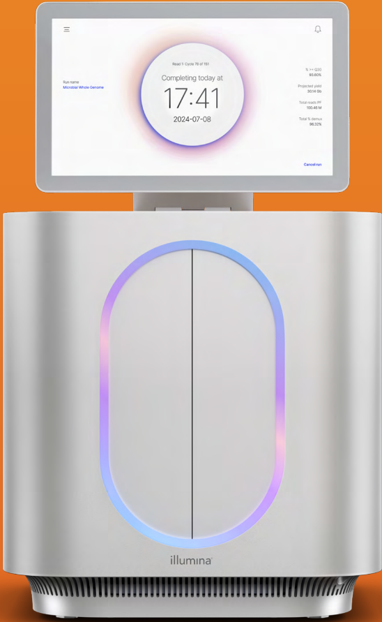
MiSeq i100 Plus System