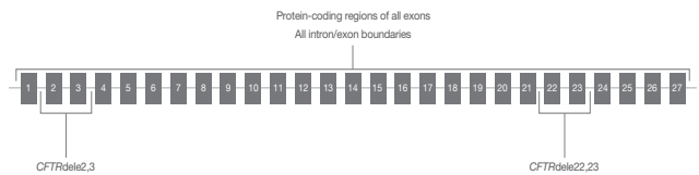
Figure 3: CFTR regions sequenced with the TruSight Cystic Fibrosis Clinical Sequencing Assay— CFTR regions sequenced by the assay include protein coding regions across all exons, intron/exon boundaries, ~100 nt of flanking sequence at the 5' and 3' UTRs, two deep intronic mutations (1811+1.6kbA>G, 3489+10kbC>T), two large deletions (CFTRdele2,3, CFTRdele22,23) and the PolyTG/PolyT region.