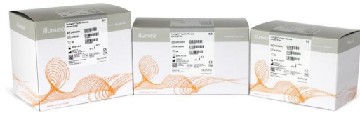
Figure 1: TruSight Cystic Fibrosis—TruSight Cystic Fibrosis combines preexisting assays into a single kit to increase versatility and sample throughput.

TruSight Cystic Fibrosis combines the MiSeqDx Cystic Fibrosis 139-Variant Assay and MiSeqDx Cystic Fibrosis Clinical Sequencing Assay into a single kit to increase versatility and sample throughput with updated sequencing reagents while maintaining the same workflow, product specifications, and performance as the original assays. As part of the integration into TruSight Cystic Fibrosis, the assay names have been changed to the TruSight Cystic Fibrosis 139-Variant Assay and the TruSight Cystic Fibrosis Clinical Sequencing Assay.